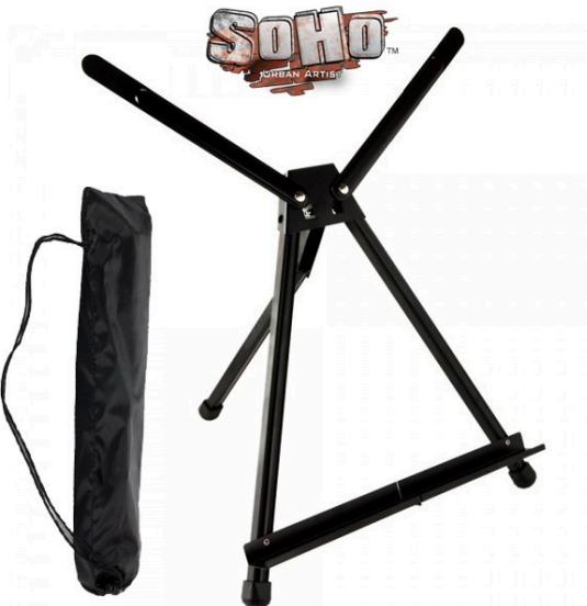
Table top easel Acrylic painting usually requires an easel. There are cheap and lightweight tabletop easels that work perfectly.