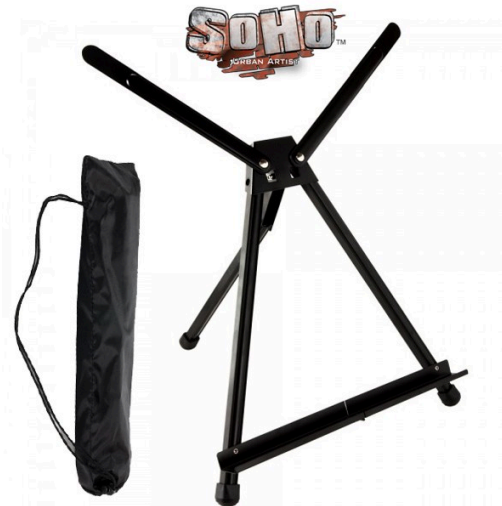
Table top easel – You can paint flat, especially if using a board. But painting on canvas usually requires an easel. There are cheap and lightweight tabletop easels that work perfect.